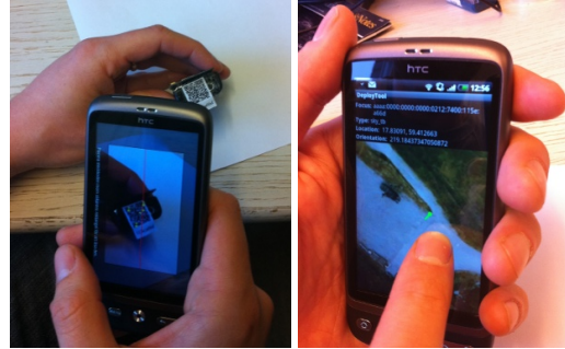
Figure 2. Node identification (left): the QR code on the mote is automatically identified and the containing information is decoded by the smartphone application. Node positioning (right): after the node has been identified, the user gives the position and direction of the node on the map view.

We demonstrate the full Snap system with a set of 10 Tmote Sky motes, an Android smartphone, and a deployment database and appstore, which runs on a laptop. Users can identify and position nodes in the smartphone interface and select software to be downloaded to the motes. One of the applications is a simple data collection application that reports data to a laptop computer, which shows the data being collected. Every mote runs a background application that estimates their power consumption with the Contiki power-trace power tracking mechanism and sends the data to the sink. Another laptop displays the power samples, which demonstrates the low-power operation of the system. We use